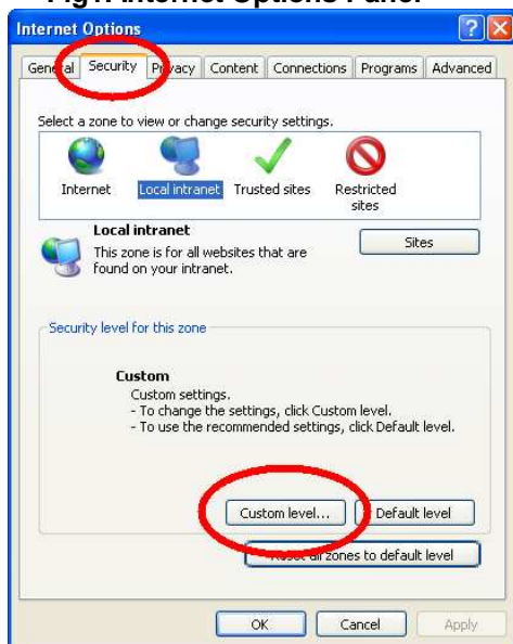
Fig1. Internet Options Panel